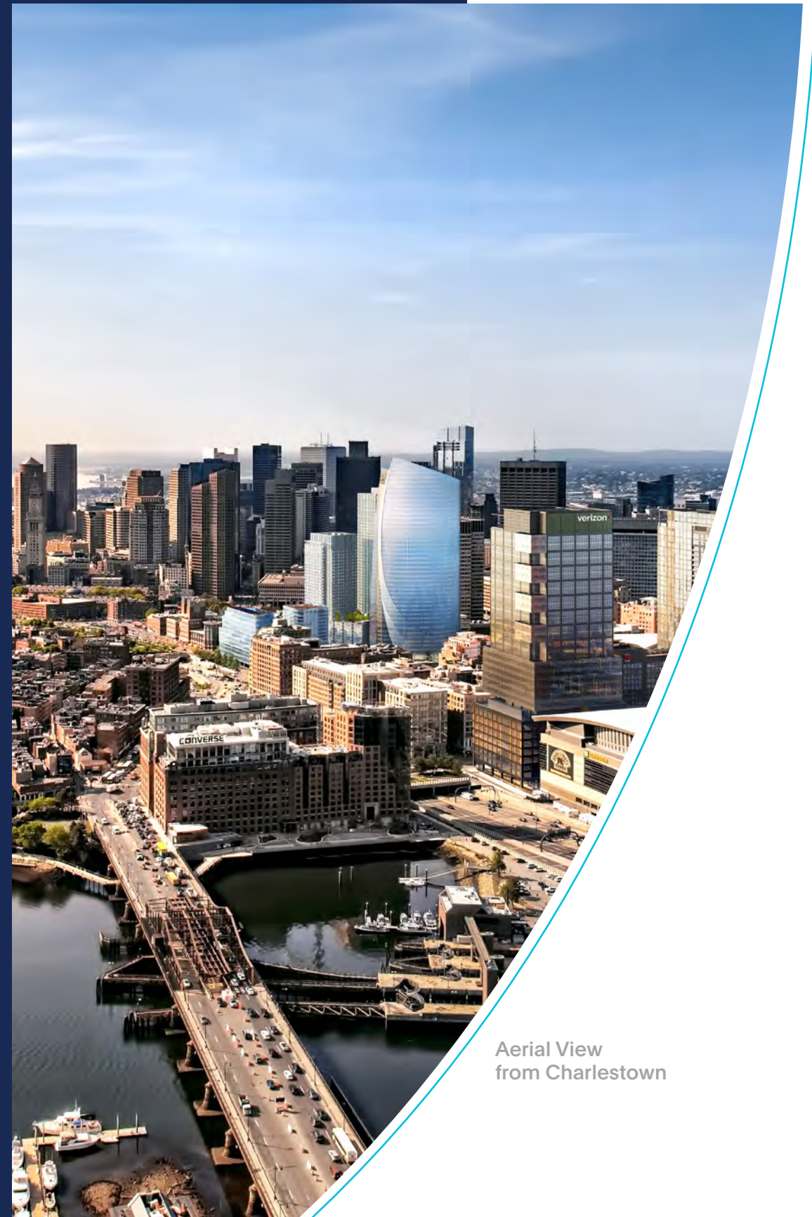
Aerial View from Charlestown