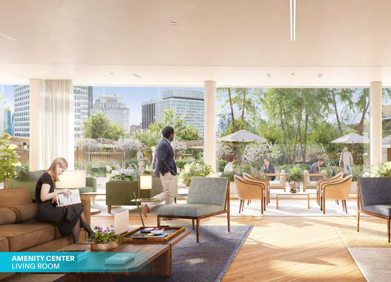
AMENITY CENTER LIVING ROOM