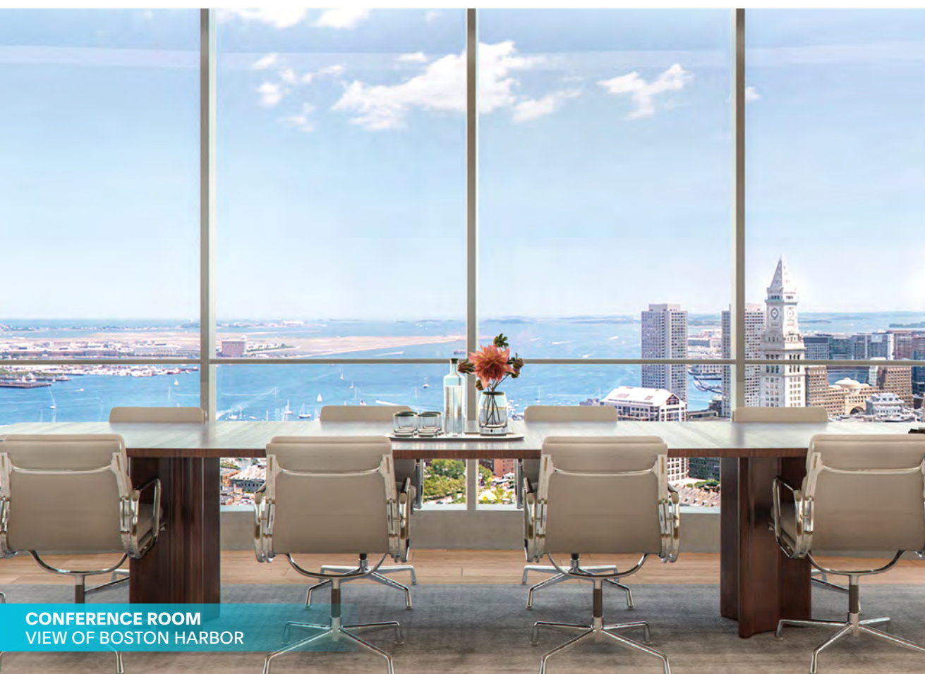
CONFERENCE ROOM VIEW OF BOSTON HARBOR