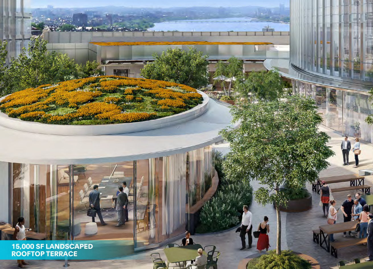
15,000 SF LANDSCAPED ROOFTOP TERRACE