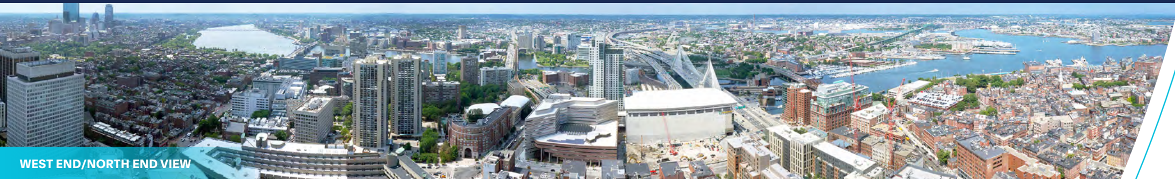
WEST END/NORTH END VIEW

Rising 600 feet in the Boston skyline, One Congress will offer unrivaled views and unparalleled visibility. This height combined with the adjacent low height historic districts will offer spectacular 360-degree views of Boston Harbor, Financial District, North End, West End, Back Bay, Beacon Hill, Charlestown, and the Zakim and Tobin bridges.