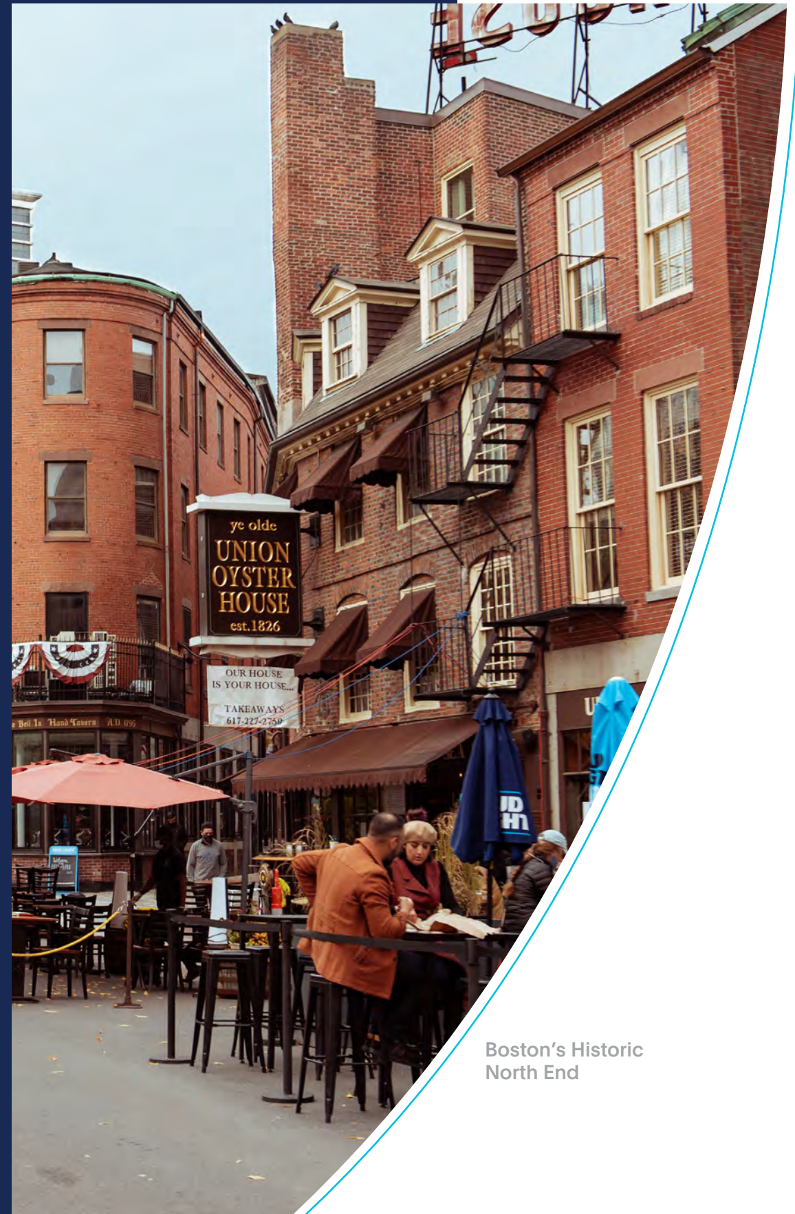
Boston's Historic North End