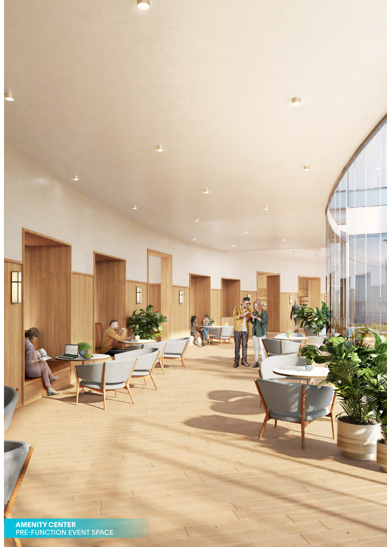
AMENITY CENTER PRE-FUNCTION EVENT SPACE