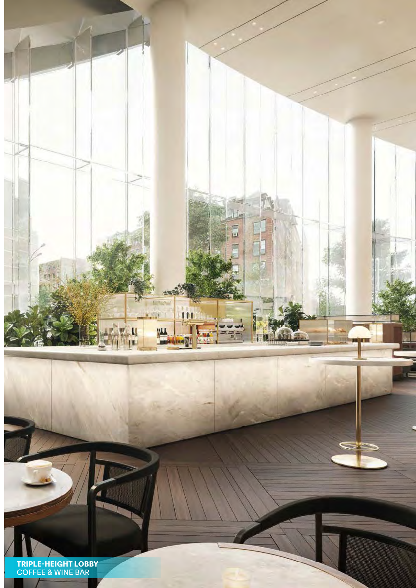
TRIPLE-HEIGHT LOBBY COFFEE & WINE BAR